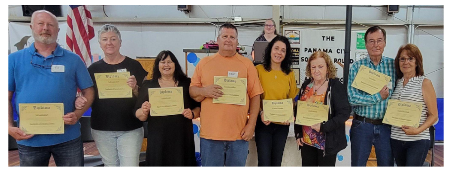
Swinging Squares Graduation students